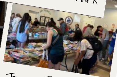
June Book Sale