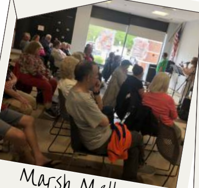
Marsh Melbaws Concert