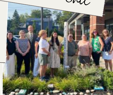
Peace Pole Dedication