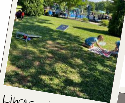
Library in the Park